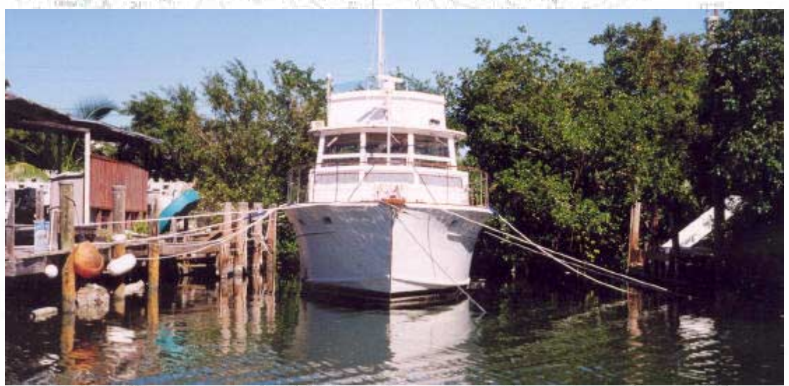
M/V Creative Touch preparing for Hurricane Irene, Marathon Florida, 1999